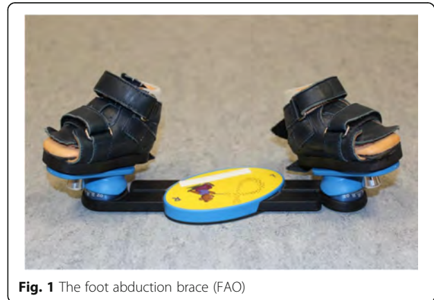
Fig. 1 The foot abduction brace (FAO)

At each visit, we asked the parents about difficulties in complying with the bracing protocol. If the brace or orthosis was not put on for 23 h during the first 3 months of life and for at least 10 h per night until the end of the third year of life, it was regarded as non-compliance, and the reasons given by the parents