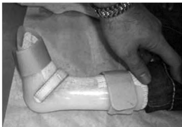
Fig. 6 The orthosis used by Janicki et al. 2011, following the classic AFO design [23]

At present, it is of doubt whether an ‘ankle–foot orthosis’ can guarantee foot abduction or external rotation [3, 22, 23] representing major columns in treating clubfeet. To our knowledge, the literature has so far reported only two studies of post-Ponseti bracing with a unilateral ankle–foot orthosis. Janicki et al. investigated the use of a classic AFO fixed with Velcro straps [23] (Fig. 6), while