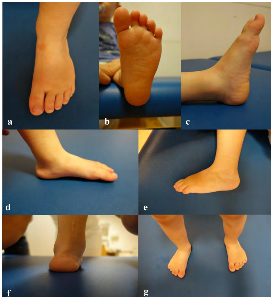
Fig. 5 a-g This otherwise healthy boy (same boy as in Fig. 2) presented at birth with a congenital vertical talus at the right foot and a congenital clubfoot at the left side (Pirani score 6, stiff-soft). His treatment with LLO started right after removing the last casts. At the time the photographs were taken, he was 2.5 years old. (a + b) There is only minimal adduction of the greater toe and neutral orientation of the left forefoot (c, d) . The heel is in slight valgus position (f) . Residual from his deformity is a pronounced internal rotation of the left tibia (g)