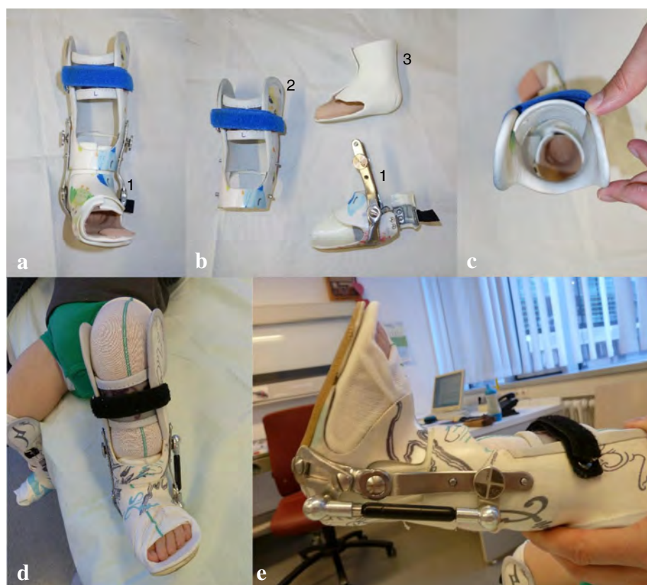
Fig. 2 a-e The Pohlig lower leg orthosis (LLO). a + b Note the circular foot unit (1) closed by a heel cap as seen in b ), the lower leg unit (2) and the inner liner made out of Tepefoam (3). The calcaneo-pedis block is held in 20° external rotation (see a and c ) and 20° dorsal extension (see e ). A mounted gas pressure spring to push into dorsal extension that can be adjusted, if desired, is also shown

plantarflexion/dorsiflexion. Rotational stability of the orthosis in relation to the axis of the knee is mandatory to maintain the position and therefore the correctional capacity of the foot unit. This is achieved by mounting the lower leg unit with a combination of ear-shaped supports encompassing the femoral condyles at the proximal ending of the lower leg unit, working as a counter bearing against the rotational forces. The range of motion of the knee joint is not limited by those encompasses. Further stability is provided by a firm intake of the calf, realized by a Velcro-fixed resin cap above the tibial tuberosity that provides an intake working like a Sarmiento brace (Fig. 2a-e).