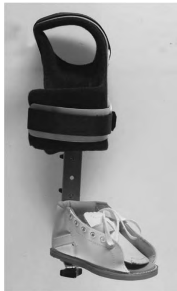
Fig. 7 The orthosis used by George et al. 2011, using a modular system [22]

In the classic orthotic AFO design as used by Janicki et al. [23] the foot is fixed into a dorsally applied shell by Velcro straps (Fig. 6). To our experience, a foot can move in a plastic half-tube shell to a certain amount around its axis, and supination of the foot is quite easily performed. In our design of the articulated lower leg orthosis the foot is held in a full-contact custom-made circular encompassing, preventing any undesired movement of the foot once the heel cap is closed. The