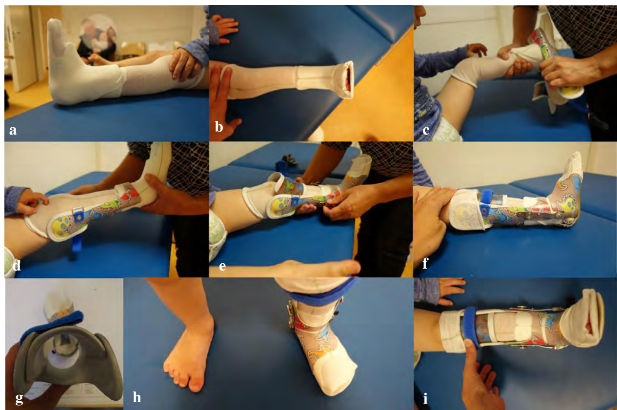
Fig. 3 a-i Putting-on of the Pohlig lower leg orthosis: (a + b) A stocking is put on the leg before the Inliner is applied, then the stocking is pulled over the Inliner (c + d) Now the lower leg unit is slipped over the foot and fixed to the shank (e) The foot unit is slipped over the foot and fixed to the lower leg unit by screws. (f, h, i) The mounted orthosis fixes the foot in neutral dorsiflexion and 20° of external rotation. Further 5–10° of dorsiflexion are allowed by hinges when walking in the orthosis (g) Top view of the orthosis, demonstrating external rotation of the foot unit versus the lower leg unit